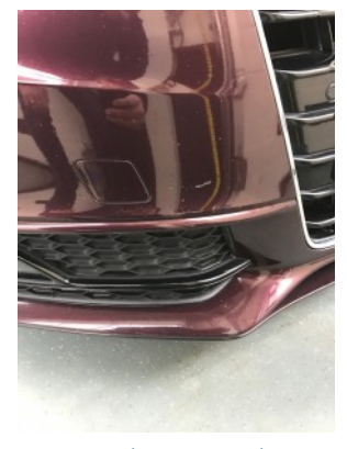
Front bumper - Scratch