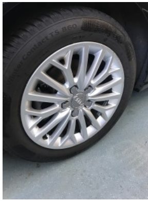
Front left rim - Scratch