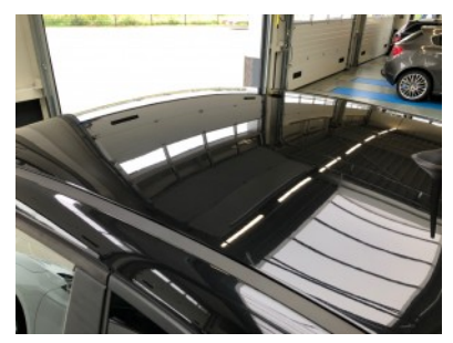
Bonnet - Hail damage