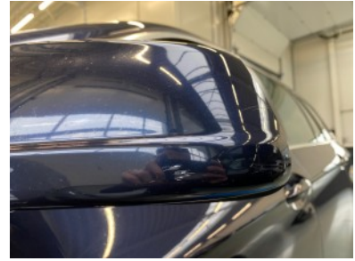
Left outside mirror - Scratch