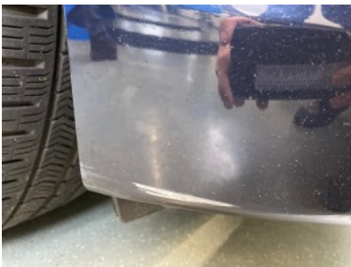
Front bumper - Scratch