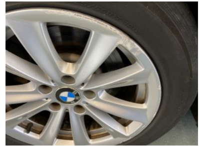
Rear right rim - Scratch