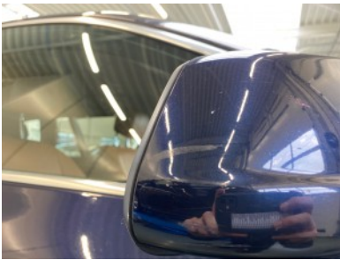
Right outside mirror - Scratch