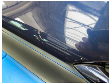
Rear left door - Scratch