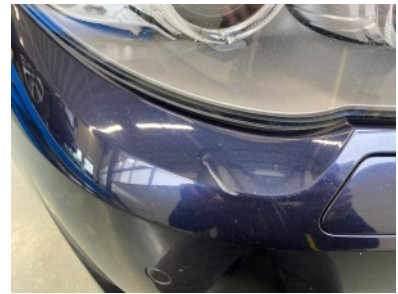
Front bumper - Scratch