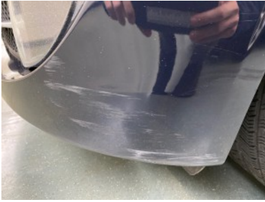
Front bumper - Scratch