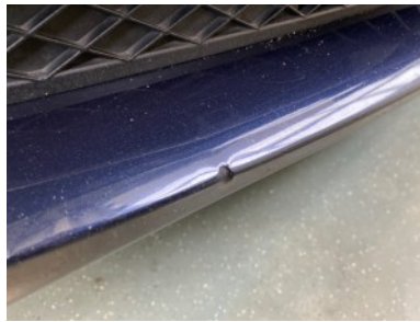
Front bumper - Dent