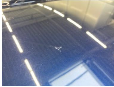
Bonnet - Scratch