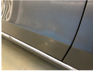
Front left door - Restyle dent