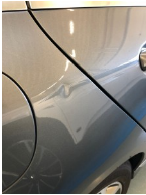
Rear right screen - Dent