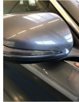
Right outside mirror - Break